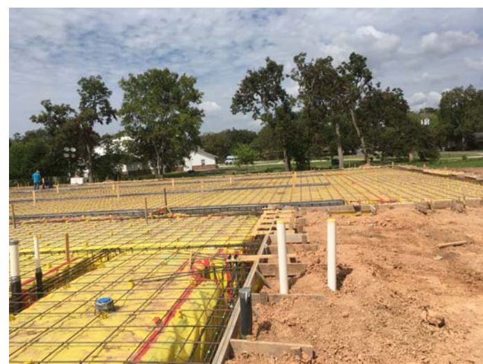
1. Concrete prep at reinforcing steel