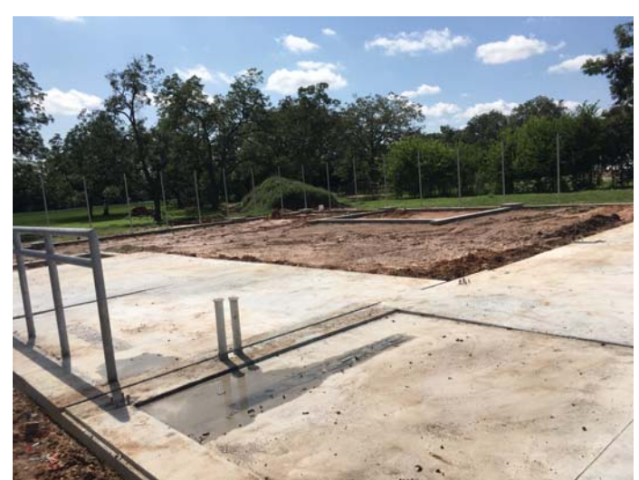
7. Concrete foundation at wash down area