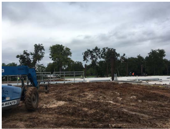
9. PEMB column erection