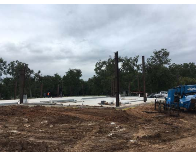
8. PEMB column erection