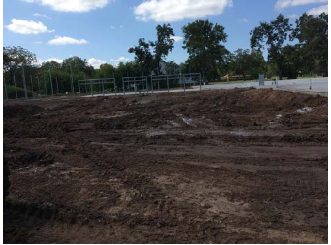
6. Rough grade after concrete for removal