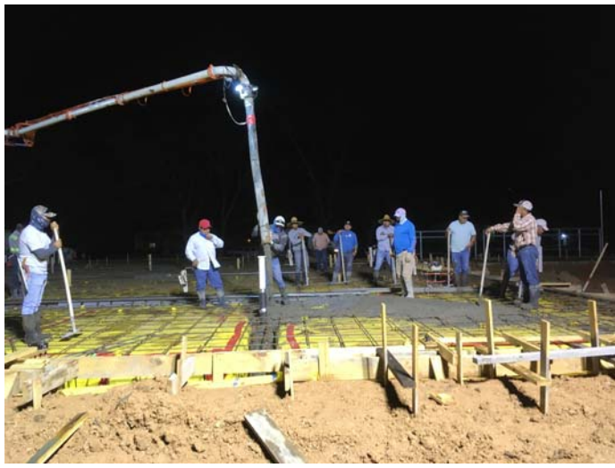
Concrete pour at slab on grade